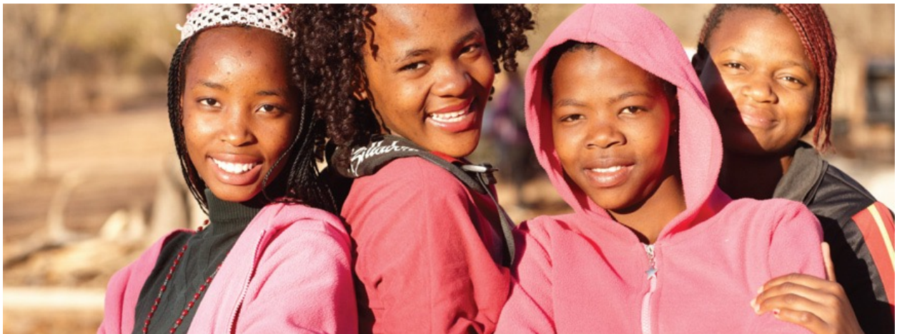
Participants from an event sponsored by the Botho Team (Botswana)