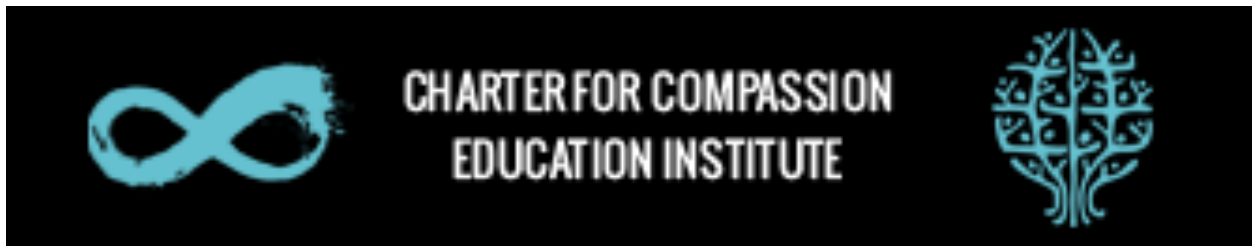
Banner for the Charter Compassion Education Institute