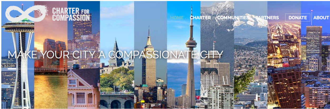
Slider page from the Charter's new website