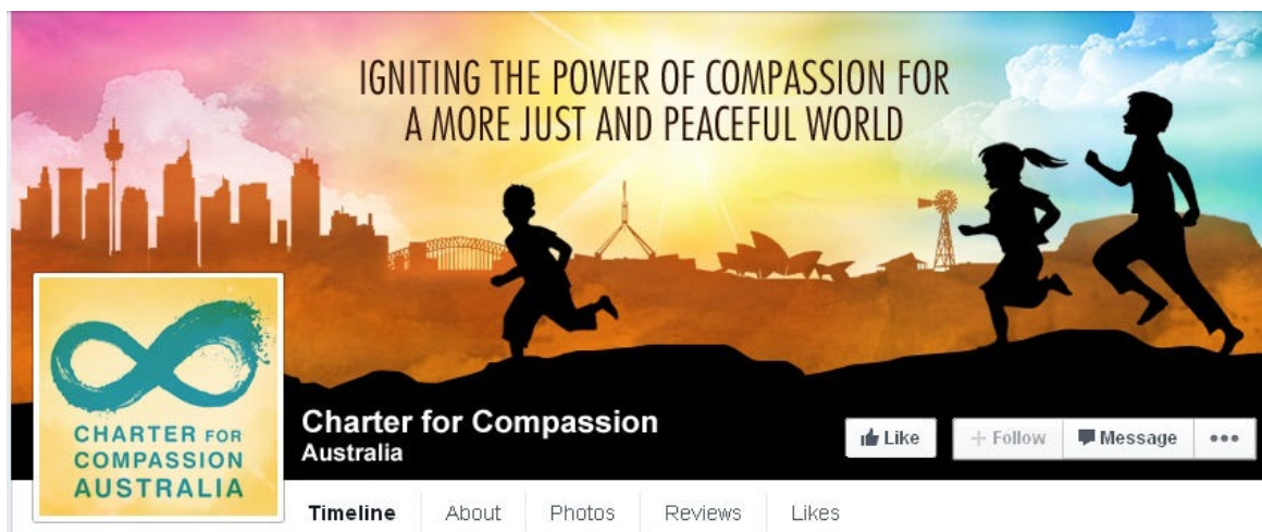
New Charter for Compassion Australia Facebook Page

Conference calls have been held between the Charter and compassionate city organizers in both areas of the world and special newsletters issued. This effort will continue until it is clear that a new structure for both hubs can be developed.