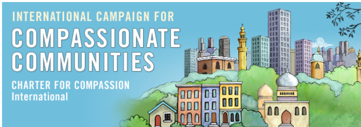
Illustration from the Cities and Communities Facebook page