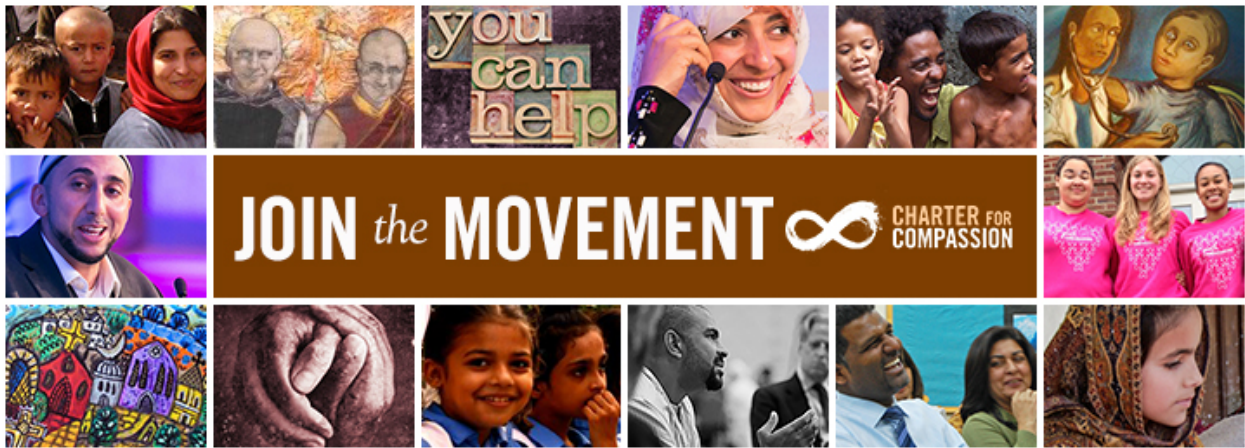
Donation page from website

In September, twelve of our lead volunteers and key partners came together for a retreat on Bainbridge Island, at their own expense, to explore how we could all serve the needs of the Charter more effectively. A conversation continues through an on-line program called SLACK: https://compassionit.slack.com/messages/_start_here/ .