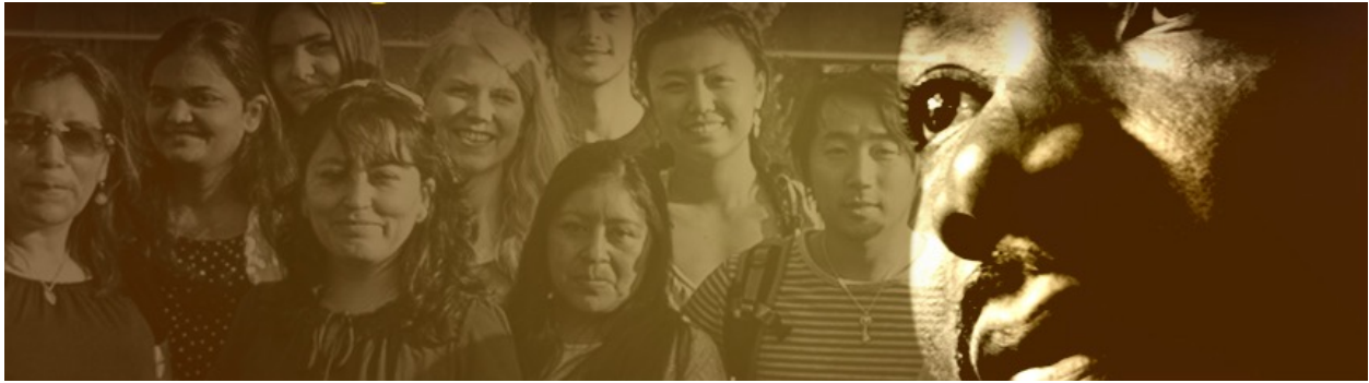
Illustration from the Charter's Beloved Community Page