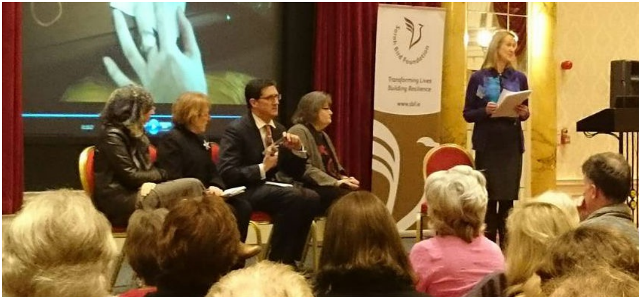
Launch of Compassionate Ireland, November 2016