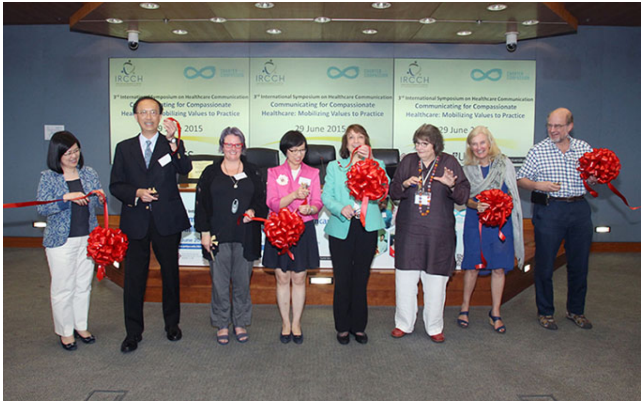
Launch of the Charter for Compassion Asia and the Pacific Healthcare Hub at the Polytechnic University in Hong Kong